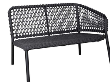
2 SEATER LEFT SOFA