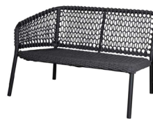
2 SEATER RIGHT SOFA